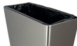
Option with concealed bag support, ref. AS-3PS