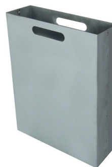
Removable container with metal bag holder ref. AS-3C0