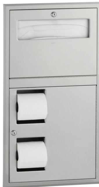
Ref. B0-34745 right side of the toilet (seated)