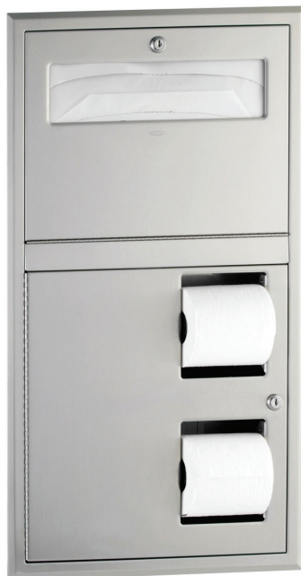
Ref. B0-3474 left side of the toilet (seated)