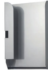
Accessory DISTRITOP included