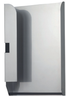
Accessory DISTRITOP included