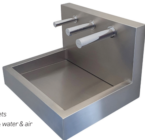
Integrated faucets RONDEO soap & water & air