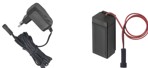
Transformer or IP67 battery box