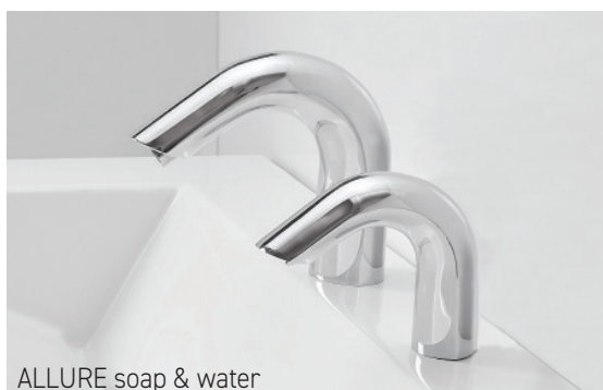
ALLURE soap & water