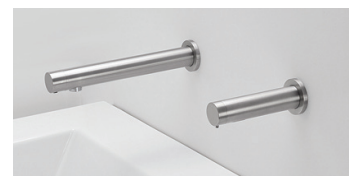
With electronic tap AKWALINE