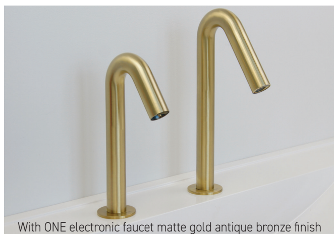
With ONE electronic faucet matte gold antique bronze finish