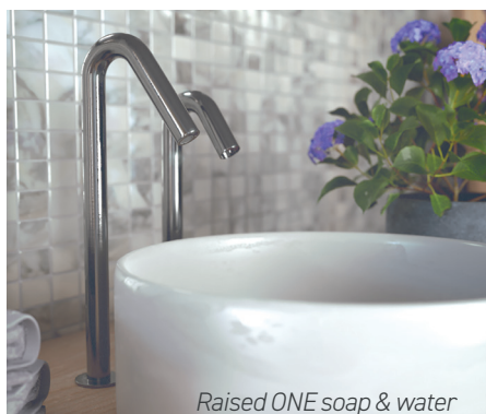
Raised ONE soap & water