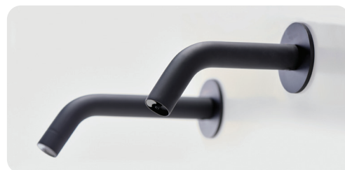
Water and soap combination, matte black finish