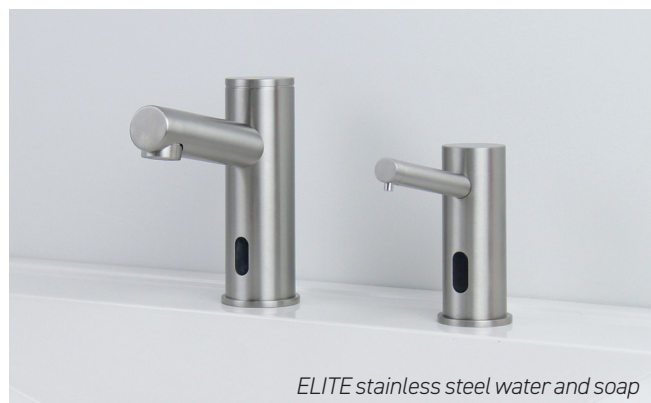
ELITE stainless steel water and soap