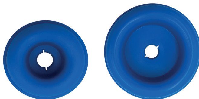
Small: 30 - 38 mm

Pipe cutter to trim the soap hose to the minimum required length.