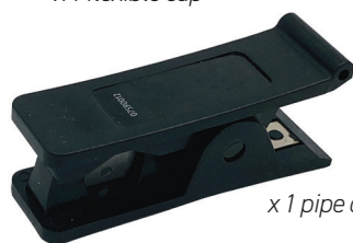
x 1 pipe cutter