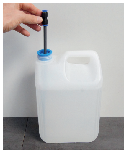
Large: 45 - 59 mm