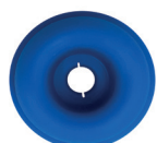
x 1 flexible cap