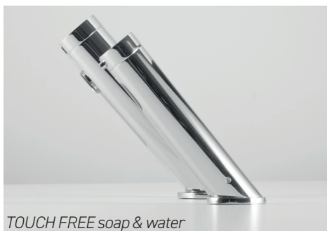
TOUCH FREE soap & water