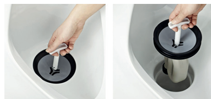
Trap removable from the top

CE certified. Electronics guaranteed for 5 years.