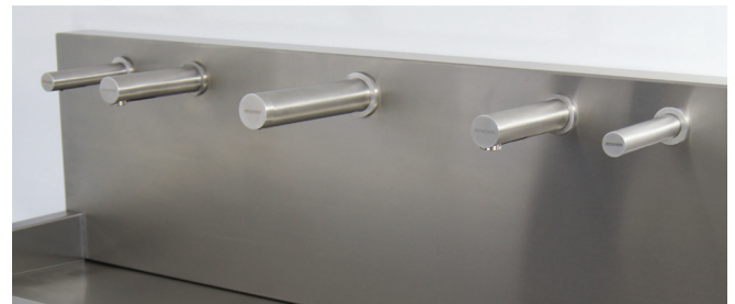
RONDEO air & water & soap