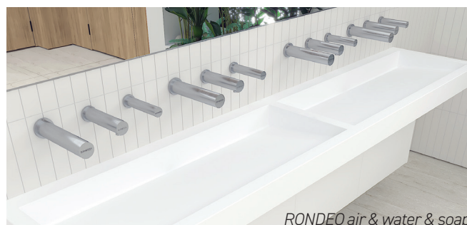
RONDEO air & water & soap