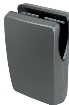
Ref. SM-ARR graphite