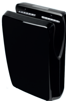
Ref. SM-ARN black