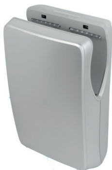
Ref. SM-ARG grey